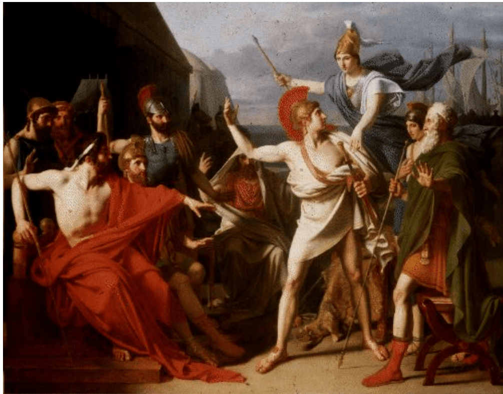
A 19th century painting of a scene from the Iliad

It is possible that Homer was a famous performer, and the epics were mistakenly attributed to him. It's also possible that the popular image of Homer as the blind bard was simply a creation of an oral tradition. Either way, we are grateful that these works have survived thousands of years so we can still learn from and enjoy them today.